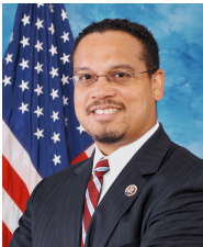
Keith Ellison (D-MN) Financial Services