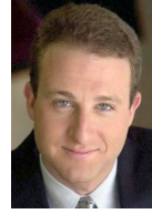
Jared Polis (D-CO) Rules 202.225.2161