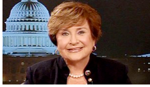
Louise Slaughter (D-MA) Rules 202.225.3615