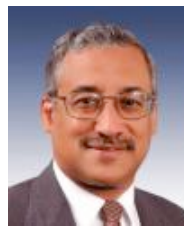
Robert Scott (D-VA)