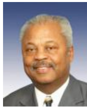
Donald Payne (D-NJ)