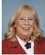
Carolyn McCarthy (D-NY)