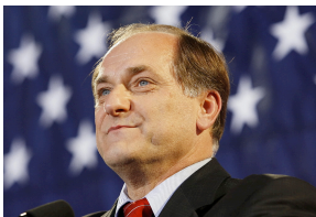
Michael Capuano (D-MA) Financial Services, Transportation and Infrastructure