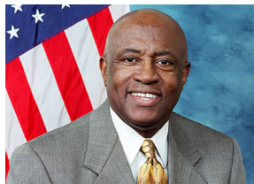
Edolphus Towns (D-NY) Energy and Commerce, Oversight and Government Reform

With support from concerned citizens contacting US Education and Workforce Committee Members urging them to support having safe USA schools, HR 3027 can become law during the 112th Congress, 2011-2012!