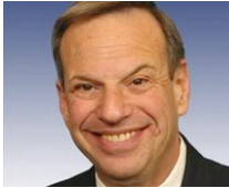
Bob Filner (D-CA) Transportation and Infrastructure and Veteran’s Affairs

The Rules Committee has power to decide if, when, and how a bill will be debated and amended on the House Floor. It has authority to grant waivers to legislation and amendments that otherwise might not be allowed to come to the Floor for consideration by the full House.